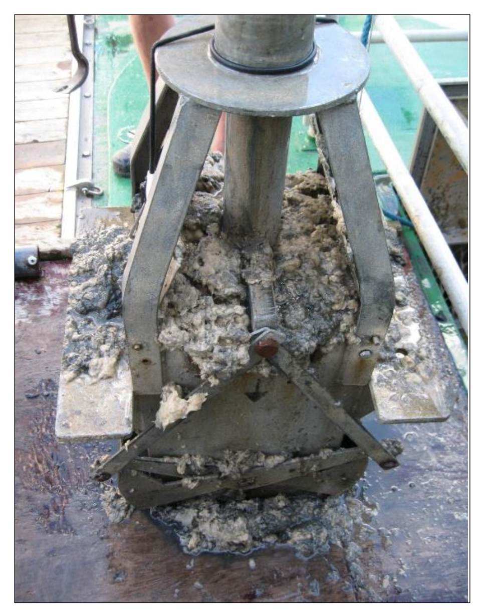
Figure 2 A grab sample of fiberbank sediment from the Ångermanälven estuary.

Because of their mixed composition, fiber-rich sediments likely display characteristics in between those of pure fiberbank deposit material and "pure" minerogenic sediment. Characteristics of fiber-rich sediments also likely differ between (and within) sites due to spatial variability in deposition of new sediment, the extent of vertical mixing by benthic activity, re-distribution by waves and currents, etc. (Figure 1).